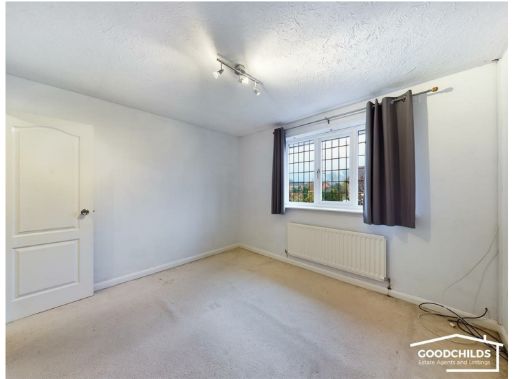
UPVC double glazed window to rear and gas radiator