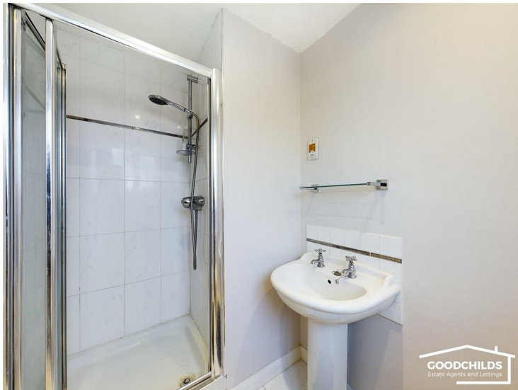
UPVC double glazed window to side, shower cubicle with thermostatic shower and tiled walls, low level WC, pedestal basin with splash back tiles and radiator