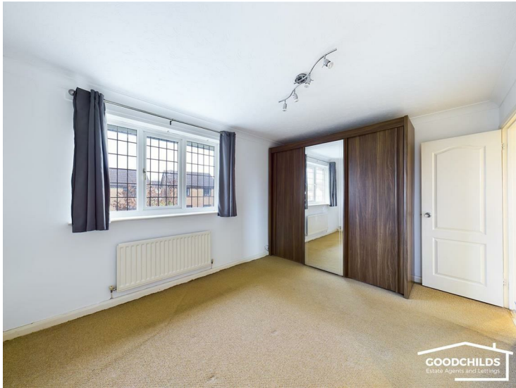
UPVC double glazed windows to rear, freestanding wardrobe and gas radiator