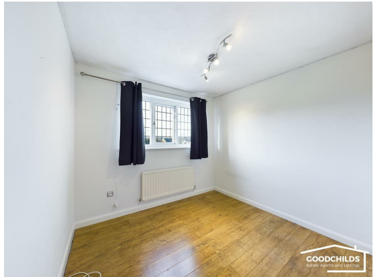
UPVC double glazed window to front, wooden effect laminate flooring and gas radiator